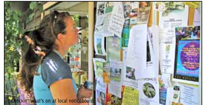
Checkin' what's on at local noticeboard

Look online at www.discoveryislands.ca for ideas on making travel plans to reach Campbell River by air, land and sea.