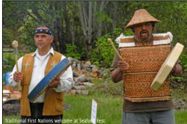
Traditional First Nations welcome at Seafood Fest.

Gorge Harbour has a marina, and there are government wharves at Cortes Bay, Whaletown, Squirrel Cove, Manson's Landing, and Gorge Harbour. Services vary but may include, shore power, garbage drop and of course moorage.