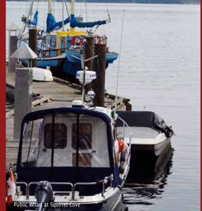
Public Wharf at Squirrel Cove