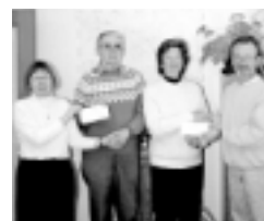
Quadra Credit Union donates $10,000 see page 13