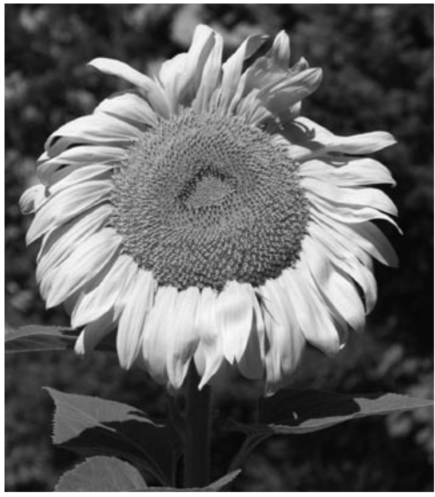
Glorious sunflowers are one of the many items available on the Green Space Design website.

"I put a generous number of seeds in each packet. I'm not going to get rich doing this, but I want people to be satisfied with what they get," Judy noted.