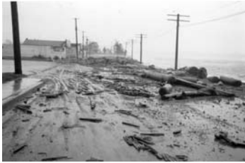
Shoppers Row after a southeaster, circa 1955