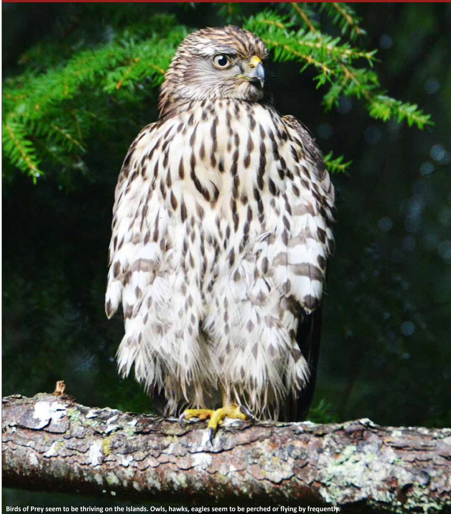
Birds of Prey seem to be thriving on the Islands. Owls, hawks, eagles seem to be perched or flying by frequently.