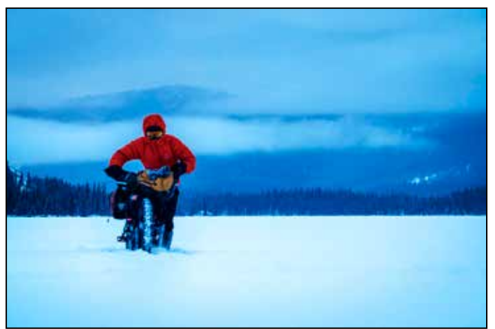
From The Frozen Road

Wednesday and Thursday November 29th and 30th along with a third, nearby show on Quadra Island on Saturday, December 2nd.