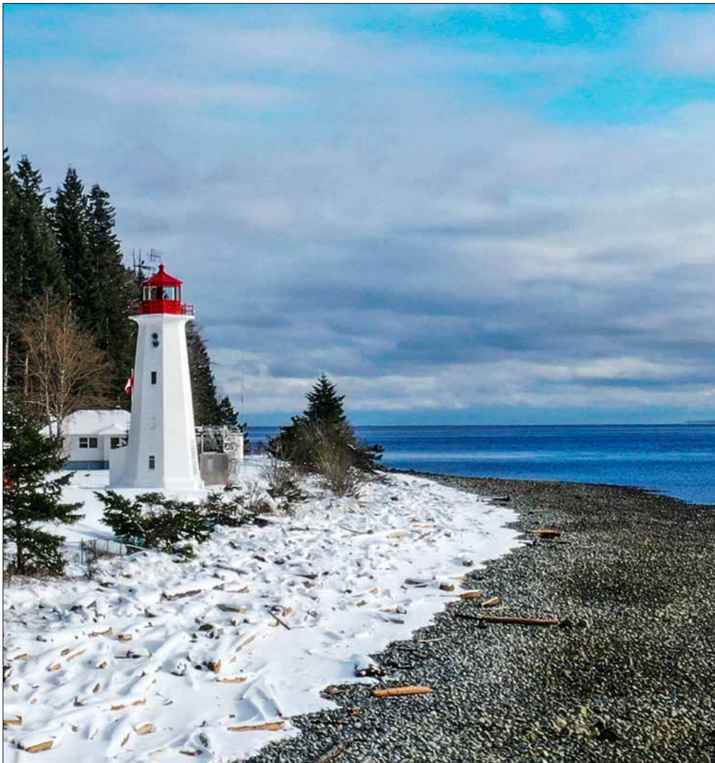
Cape Mudge Lighthouse