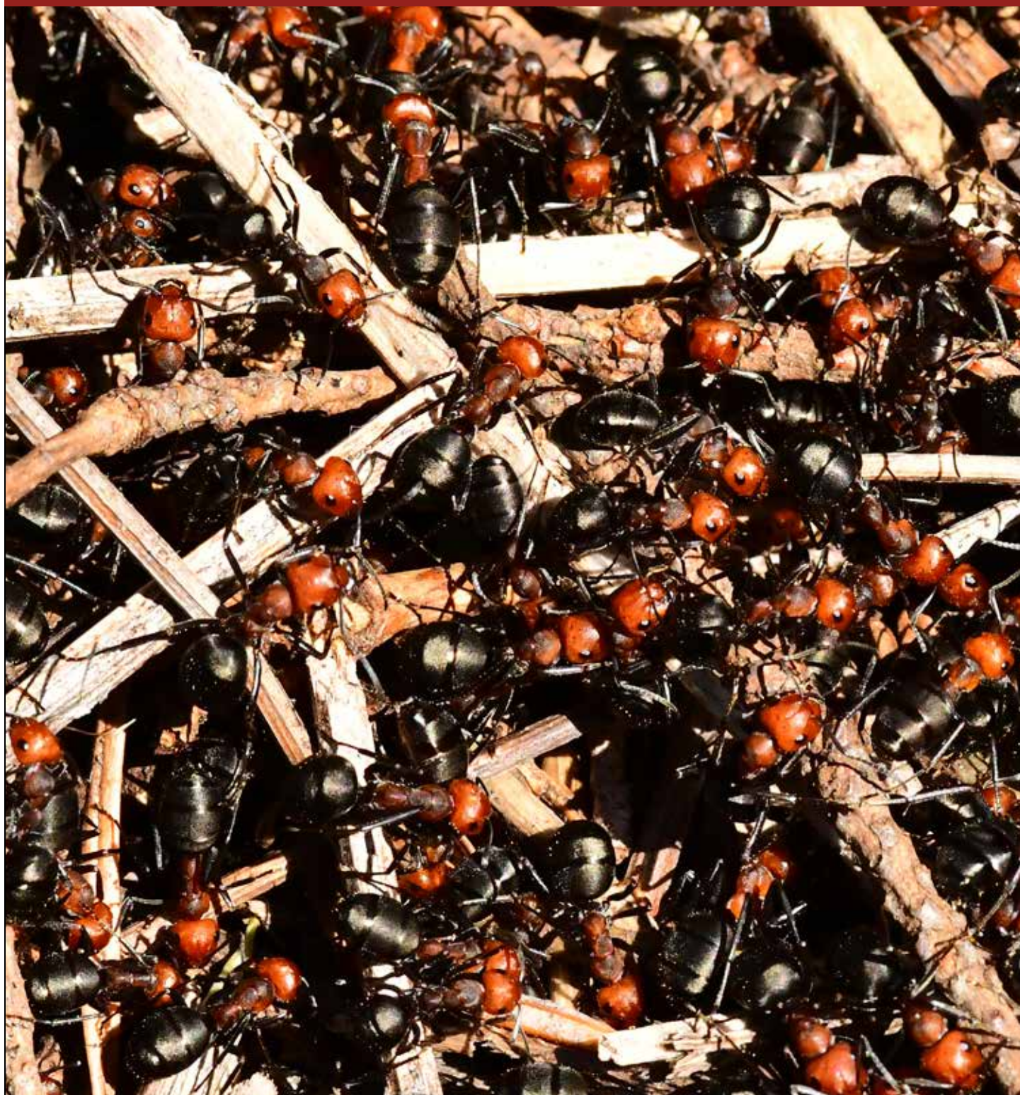
Mounding Ants busy at work in the spring sunshine. See story page 14.