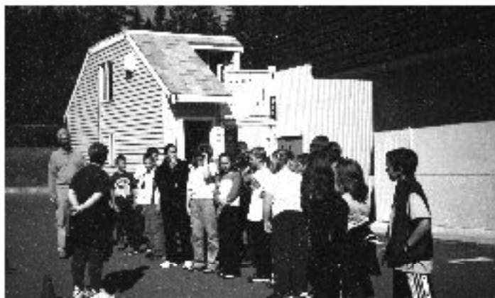
Quadra Elementary students preparing to enter the fire safety house for a safety drill. Watch out next issue for the full story.

This column appears in the Discovery Islander every second issue. Our thanks to the publishers for giving us this opportunity. If you ever have any topics that you would like covered regarding the Fire Department, fire safety regulations, etc., or questions that we may be able to answer, please feel free to contact us: QIVFD, Box 80, Quathiasli Cove, BC, V0P 1N0, Attn: Fire Chief