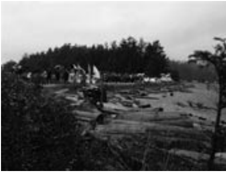
May Day 2002 Parade