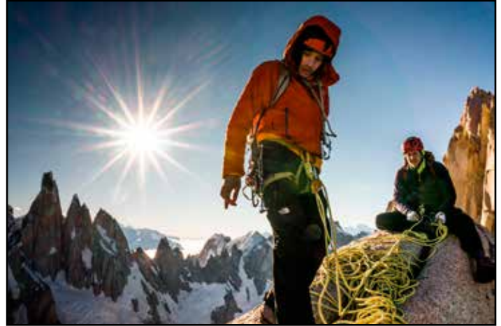
REEL ROCK 10 A Line Across the Sky

In an action-packed line up look for A Line Across the Sky which won the Best Climbing Film category, sponsored by Alpine Club of Canada. This