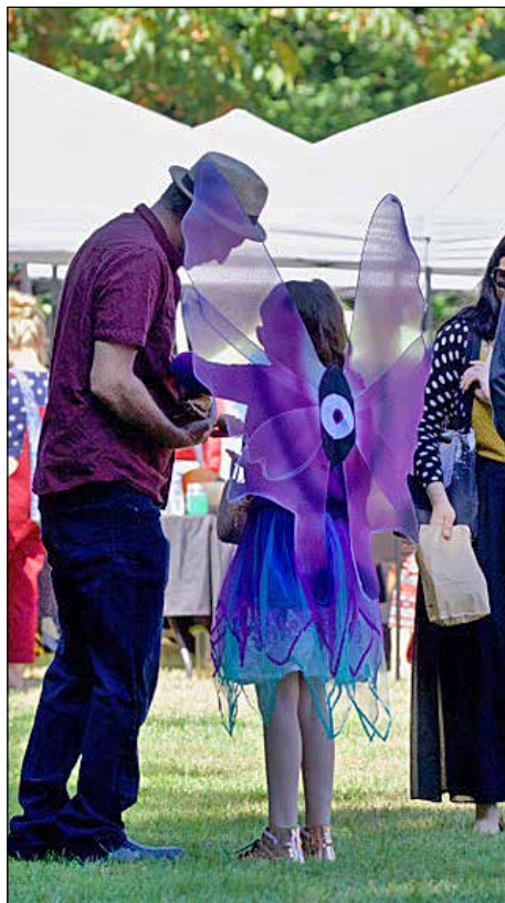
Fairy SEEN shopping

A record Saturday of Vendors came out to the market this week. Thanks to everyone for their cooperation with making a smooth set up. the Quadra Market is unique with all types of art, wares and creations from locally made to imported from far, new and used, recycled and upcycled, massage and live music as well to keep you relaxed and dancing. A friendly reminder to keep dogs on leash and away from food tables while on the grounds Thank you! info: quadramarket@gmail.com