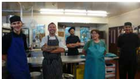
COADJUTANT KITCHEN CREW

Thanks a million trillion to our wonderful Housekeepers, Kitchen, Front Desk, Gift Shop, Marina, Campground, Accounting, Grounds, Maintenance, Marketing, Herons and the HBI Pub people, you make us the amazing place that we are. This year has been like no other, you are working through the changing times with great care and attention in a professional and kind manner. We are so proud of you and grateful for bringing your beautiful smiling faces to work each day. We look forward to continued good times working with you.