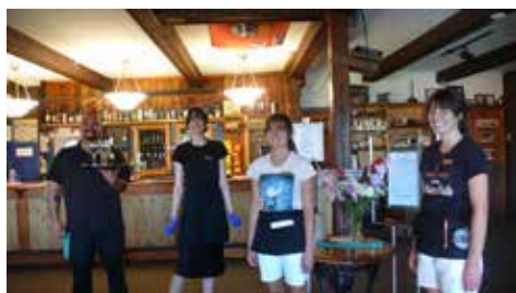
PERSPICACIOUS PRIMO PUB STAFF

Heriot Bay Inn Dining Hours are changing after September 19!