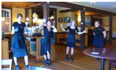
DECOROUSLY DEXTEROUS DINING STAFF