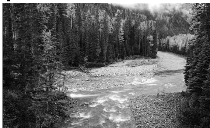
Goat River in the inland rainforest.