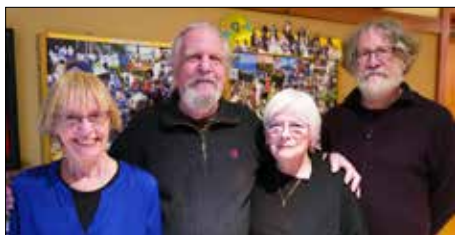
The photo is the last edition of the DI of the retiring cultural concert organizers

For more information about the Outdoor Club visit https://qioutdoorclub.org/ or email to qioutdoorclub@gmail.com