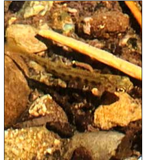
Presumed cutthroat in Pidcock Creek (only cutthroat have been identified in Pidcock)

QISES respectfully honours the traditional heritage of land and water relationships of the Liḡʷitdaḡw (Laich-Kwil-Tach) first nations: the We Wai Kai, Wei Wai Kum, and Kwiaakah